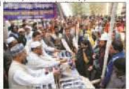
Acting Secretary General of Bangladesh Jamaat-e-Islami ATM Azharul Islam distributing warm clothes among the cold affected people Barmura in Dhaka on 21st January, 2011