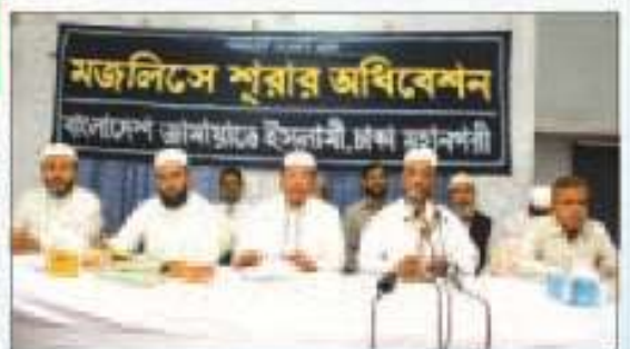
Acting Secretary General addresses a city Majlis-e-Shoora meeting as chief guest on 24 November, 2010