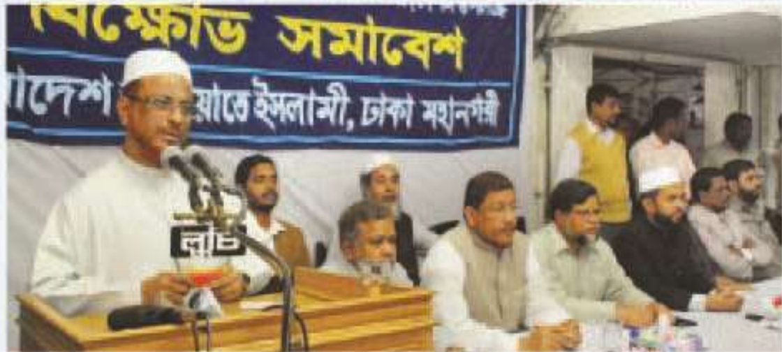
Acting Secretary General of Bangladesh Jamaat-e-Islami ATM Azharul Islam addressing a discussion at City office protesting countrywide digital vote rigging in Election Day on 29 December, 2010

Bangladesh Jamaat-e-Islami staged demonstration throughout the country protesting the digital vote rigging in the national election on 29 December, 2008. Jamaat Dhaka City organised a rally where Acting Secretary General ATM Azharul Islam was present as chief guest.