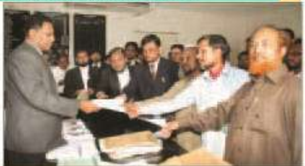
Jamaat Dhaka District North South forwarding their memorandum to the Deputy Commissioner of Dhaka District on 7 November, 2010